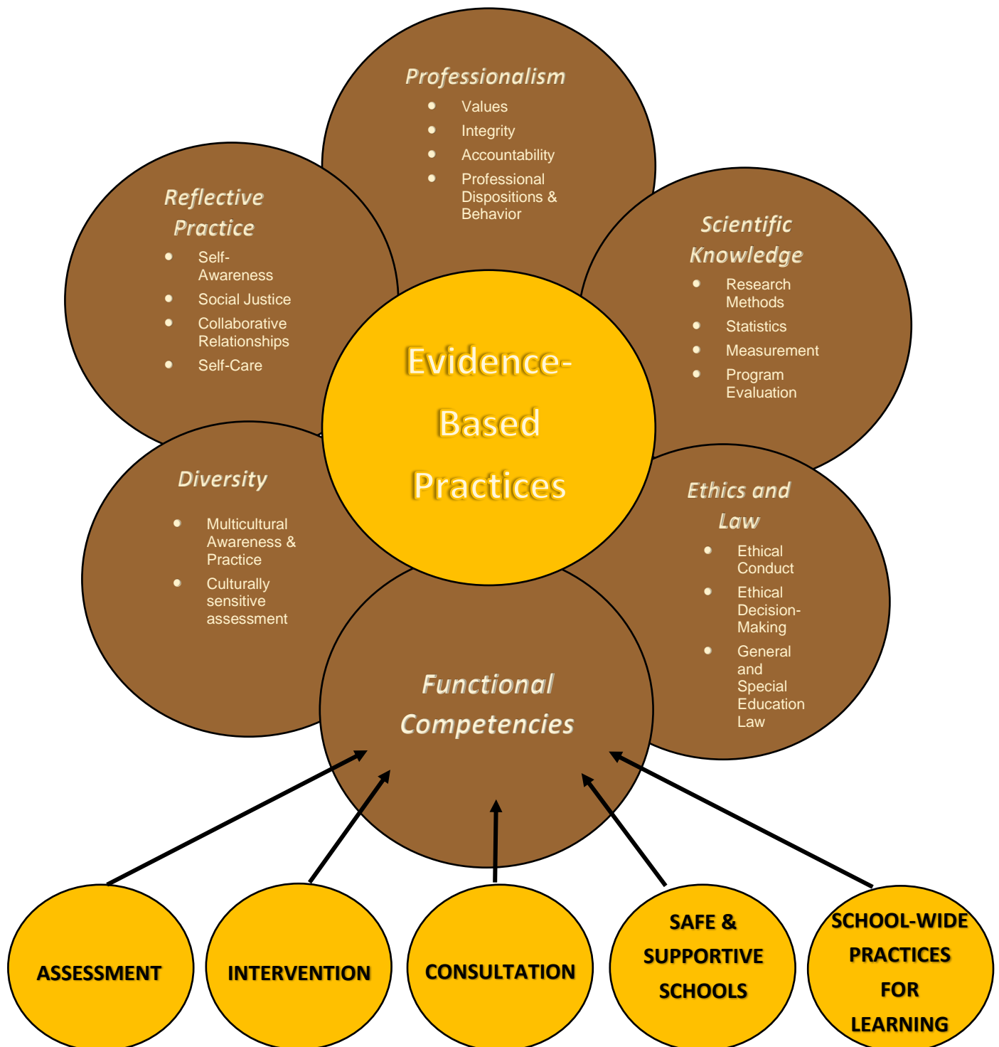
Figure 1. ADELPHI UNIVERSITY SCHOOL PSYCHOLOGY PROGRAM CONCEPTUAL FRAMEWORK