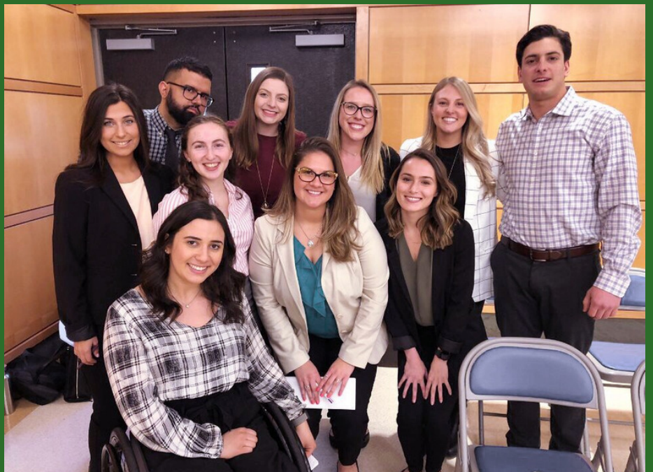
"FOR" use of apps