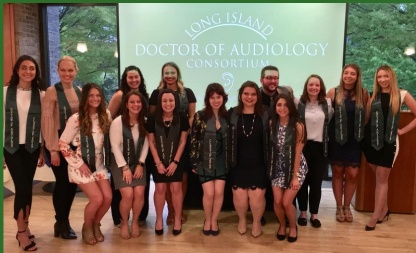
CLASS OF 2019