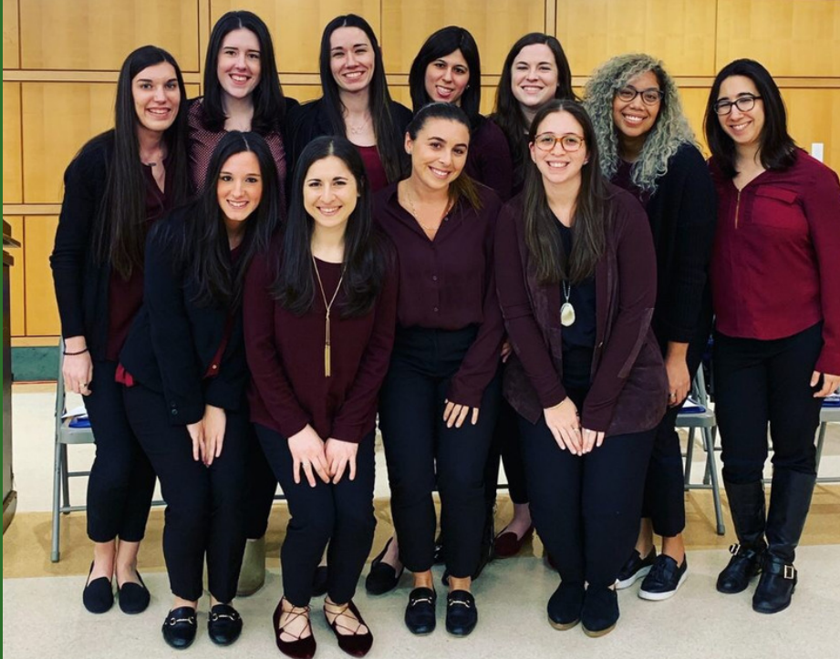
"AGAINST" use of apps