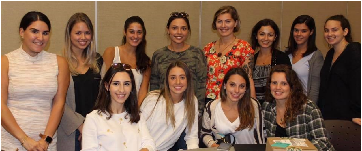
Class of 2021