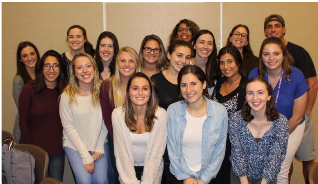
Class of 2020