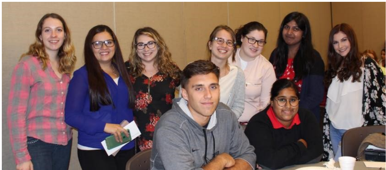
Class of 2022