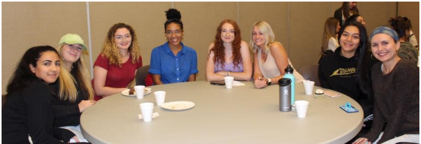
Class of 2022