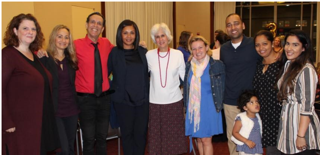
Faculty and Alumni

On October 5th, students from all four years gathered to participate in a night of fundraising, networking, and gathering as a whole program. Our wonderful students and faculty came together to help fundraise for the Consortium's annual Starkey global mission trip. This was also a wonderful opportunity for students to network with other cohorts to begin to develop lifelong professional relationships and friendships.