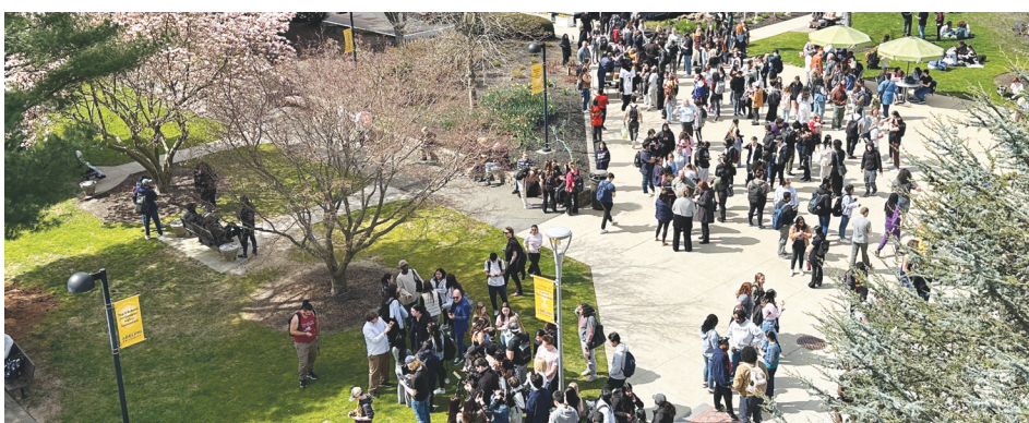
Students gathered outside Swirbul Library on April 8 to watch the solar eclipse.

Thanks to the eclipse, people all throughout the Adelphi community were brought together. 🐾