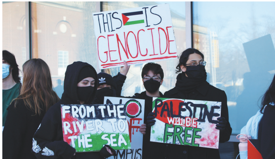
SJP eBoard and members hosted a protest outside the CRS when an IDF soldier spoke there in February.

In February, Adelphi's Chabad group hosted an Israel Defense Forces (IDF) soldier to speak on campus and a newly formed Students for Justice in Palestine (SJP) protested