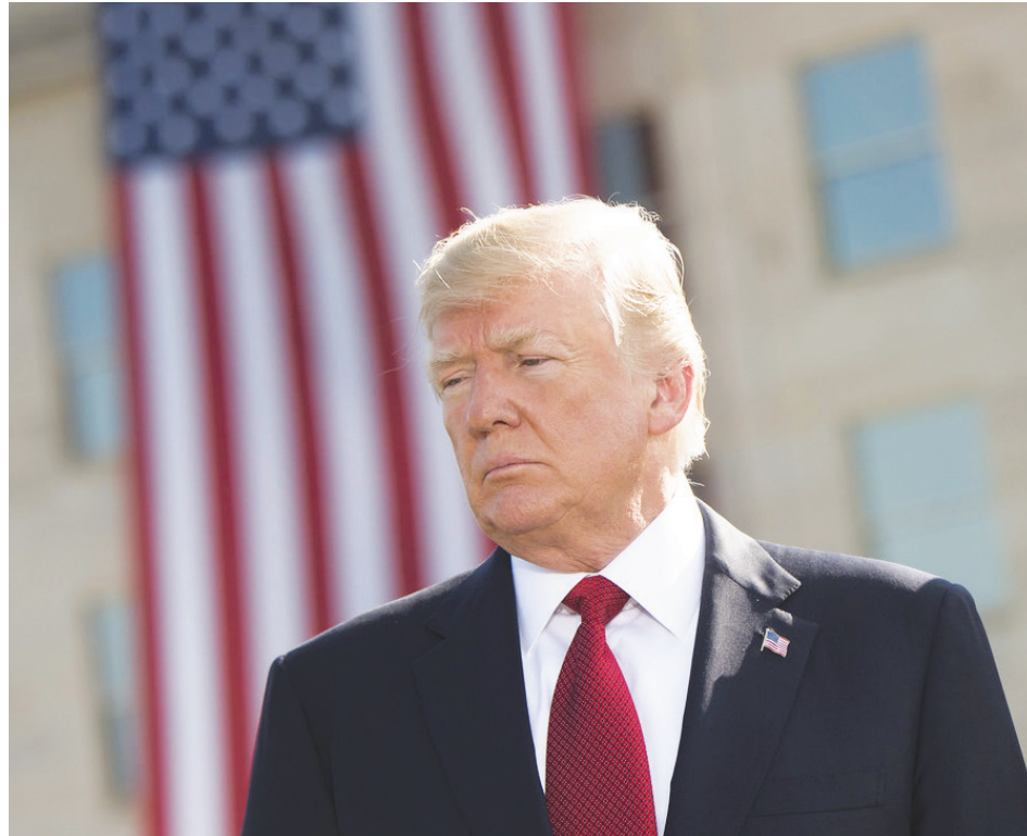
Former President Donald J. Trump has shown no sign of stepping away from the political scene, despite his growing legal battles.

and these views of what exactly is being said can change over time. To most, these specific sections appear to refer to if the president was ill in some way, such as in a coma. However, a case can be made that it goes beyond physical health.