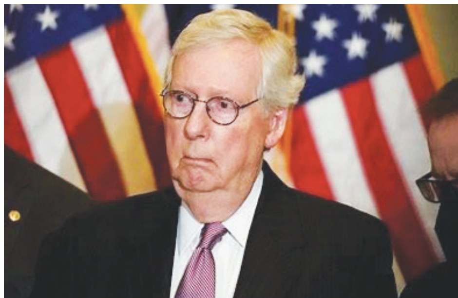
Senate Minority Leader Mitch McConnell of Kentucky, 82, will not run for the position again in November after 17 years as the Republican leader.

Younger people feel that they don't have the support and aren't as informed as they hope when it comes to the political process. This is more evident when it comes to younger people who don't have a college background and/or are a person of color. I emphasize this because I feel we need a better under-