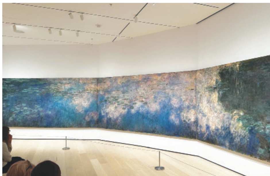
"Waterlines" by Claude Monet in MOMA

flexibility of its thickness allows us to better define the relief level on the work. We can also mix more pigments with oil. Interesting facts about pigment: