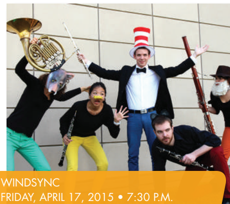
WINDSYNC FRIDAY, APRIL 17, 2015 • 7:30 P.M. TICKETS: $35/$30