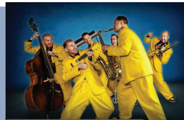
SWINGTIME! SUNDAY, MARCH 29, 2015 • 3:00 P.M. TICKETS: $40/$35