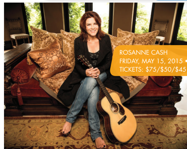
ROSANNE CASH FRIDAY, MAY 15, 2015 • 7:30 P.M. TICKETS: $75/$50/$45