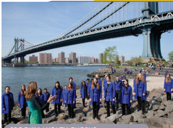
BROOKLYN YOUTH CHORUS SATURDAY, JANUARY 31, 2015 • 8:00 P.M. TICKETS: $35/$30