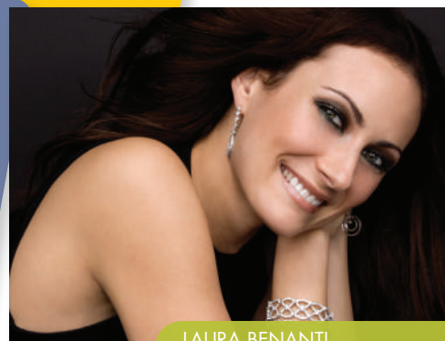
LAURA BENANTI SUNDAY, MARCH 8, 2015 • 3:00 P.M. TICKETS: $70/$45/$40