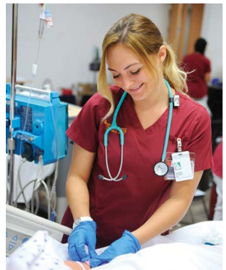
NEXUS SIM lab settings range from hospital bay (Top) to home (Bottom left).