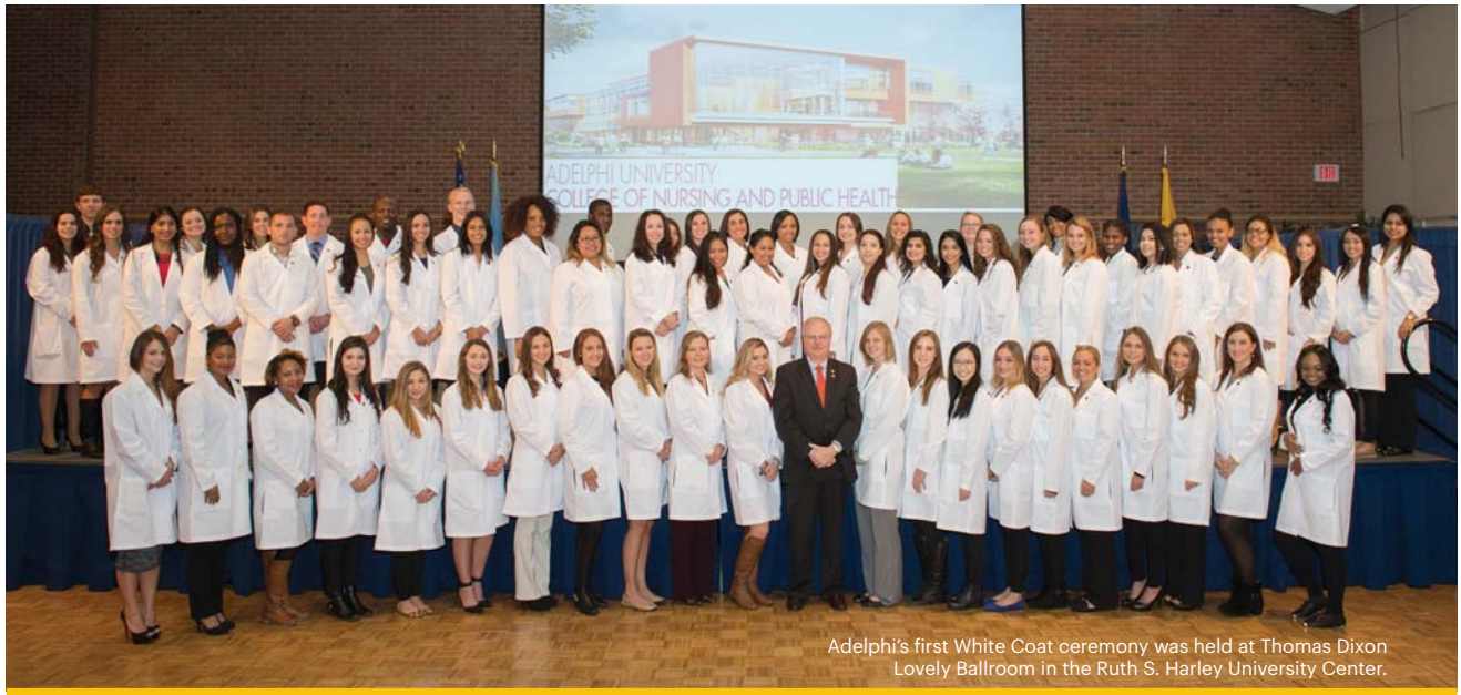
Adelphi's first White Coat ceremony was held at Thomas Dixon Lovely Ballroom in the Ruth S. Harley University Center.