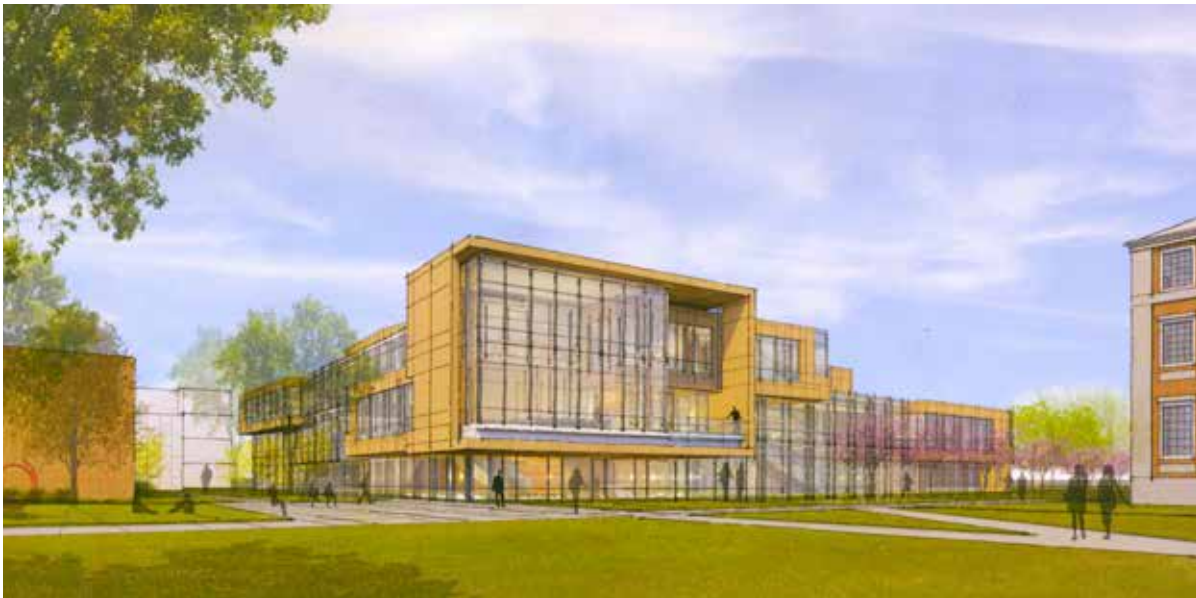
Design by Ballinger

Nearly 100,000 sq. ft. on Levermore Hall parking lot