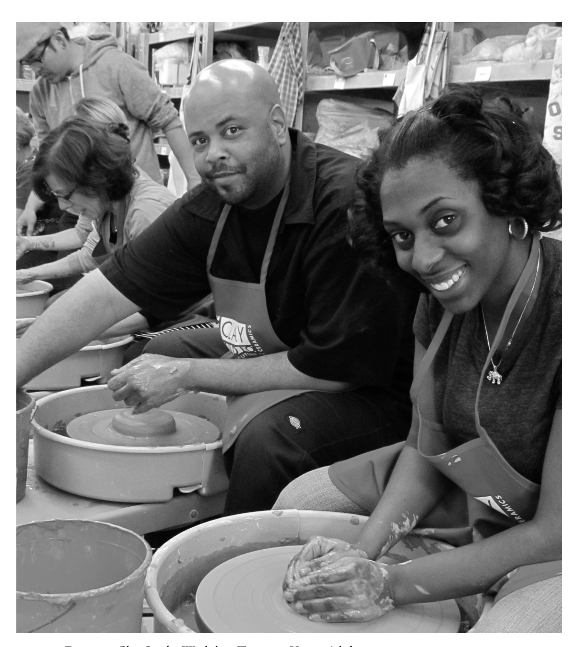
Figure 1. Clay Studio Workshop Targeting Young Adults