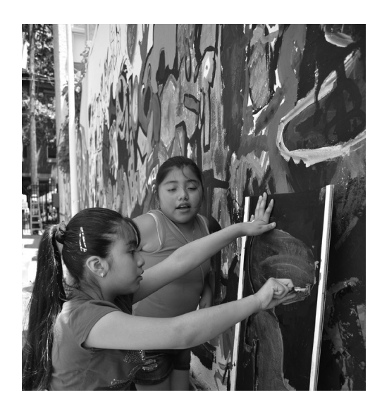
Figure 7. Fleisher Art Memorial's ColorWheels and ARTspiration! Festival