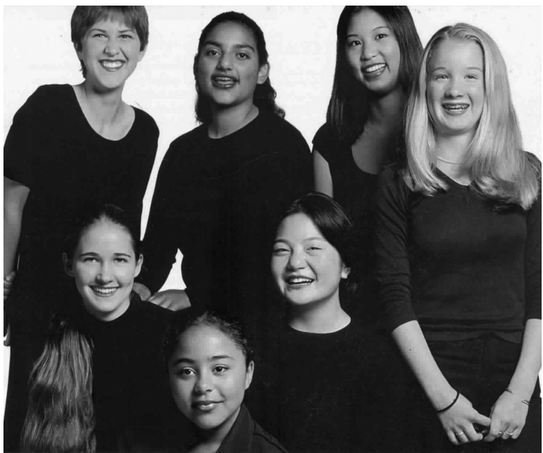
Figure 5. SFGC Images Presented to Focus Group Respondents