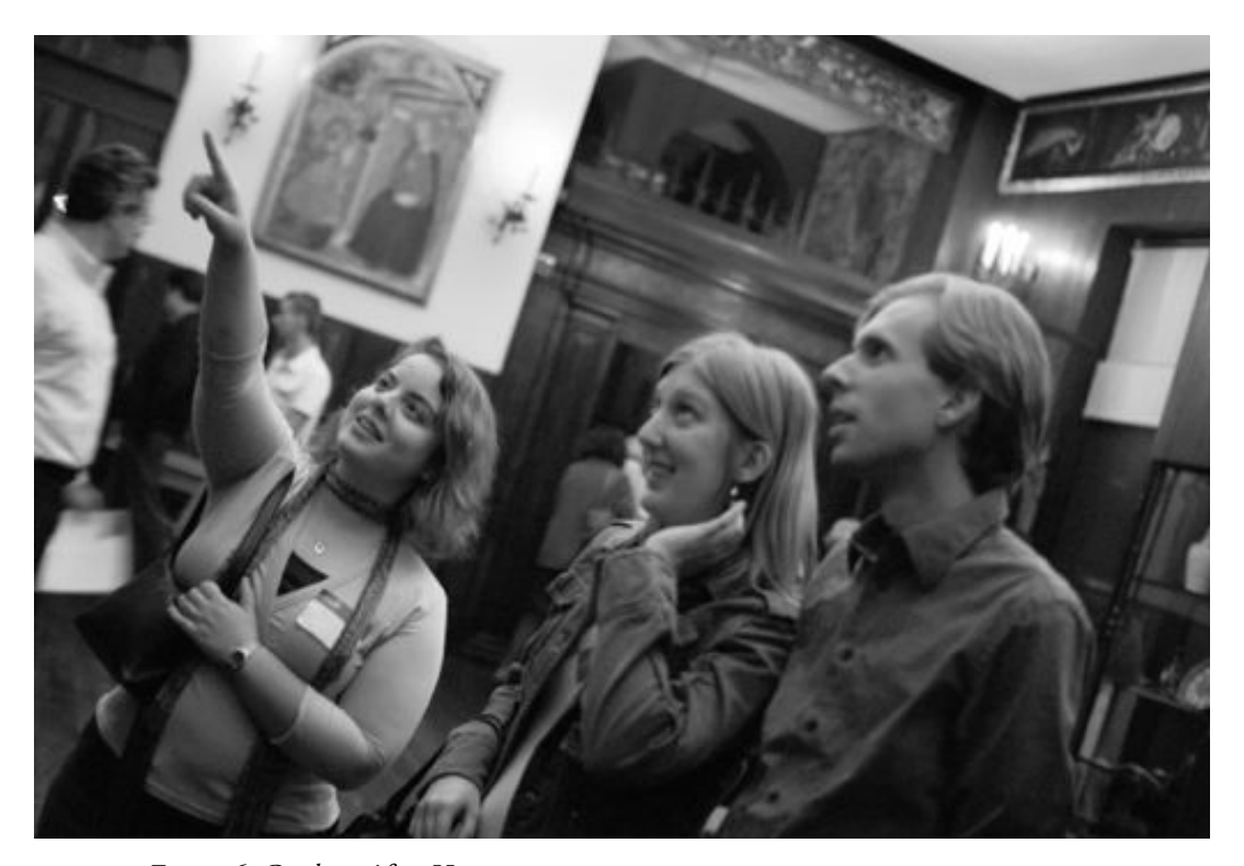
Figure 6. Gardner After Hours