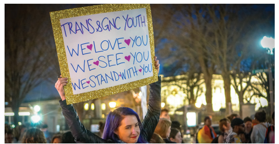
With his veto of the Arkansas SAFE Act, Governor Asa Hutchinson challenged conservative values that don't support the trans movement promoted by supporters like these pictured.

themselves. This is viewed as nothing more than demented child abuse that is antithetical to actual science and both parents and physicians are complicit.