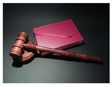
The justice system that works in the U.S. may not work in Saudi Arabia, and vice versa.

To say that a single law can thus be implemented successfully in both countries is not straightforward and does not take into account the society in practi-