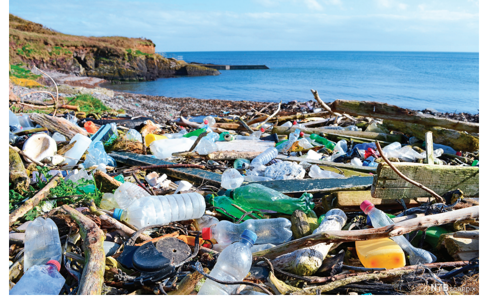
Unfortunately, banning plastic straws has not yet done much to prevent this type of marine waste washing up on our shorelines.

Ocean pollution is a problem because of plastic. In the last 10 years alone, humans have made more plastic than was made in the last century. This is an immobilizing fact, considering that by 2050 the pollution that has affected our fish will be outnumbered by plastic dumped in the ocean. Many of the effects of ocean pollution will soon be irreversible, if nothing significant is done about it. When it comes to regulating our use of plastic bags, many believe that banning plastic is dependent on whether we decide