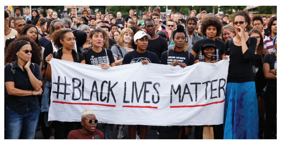
Photo from a Black Lives Matter protest.

According to Donaghue of CBS News, "in order to convict Chauvin of second-degree murder, prosecutors would need to prove beyond a reasonable doubt that Chauvin unintentionally caused Floyd's death while committing or attempting to commit a related felony-in this case third-