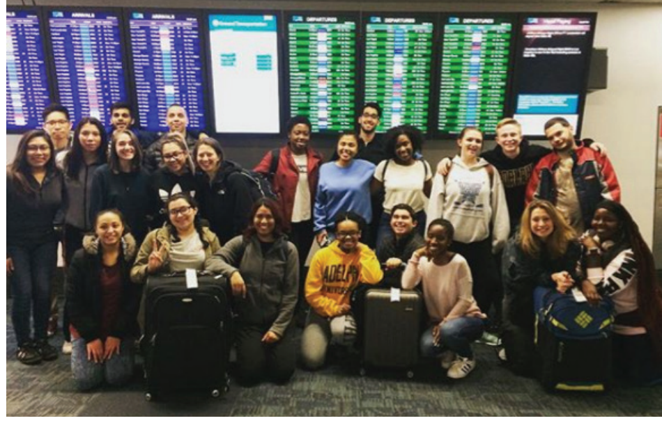
Student volunteers at the San Francisco International Airport.

"San Francisco is a city with extreme wealth but also extreme visible homelessness," he said. "Unlike New York