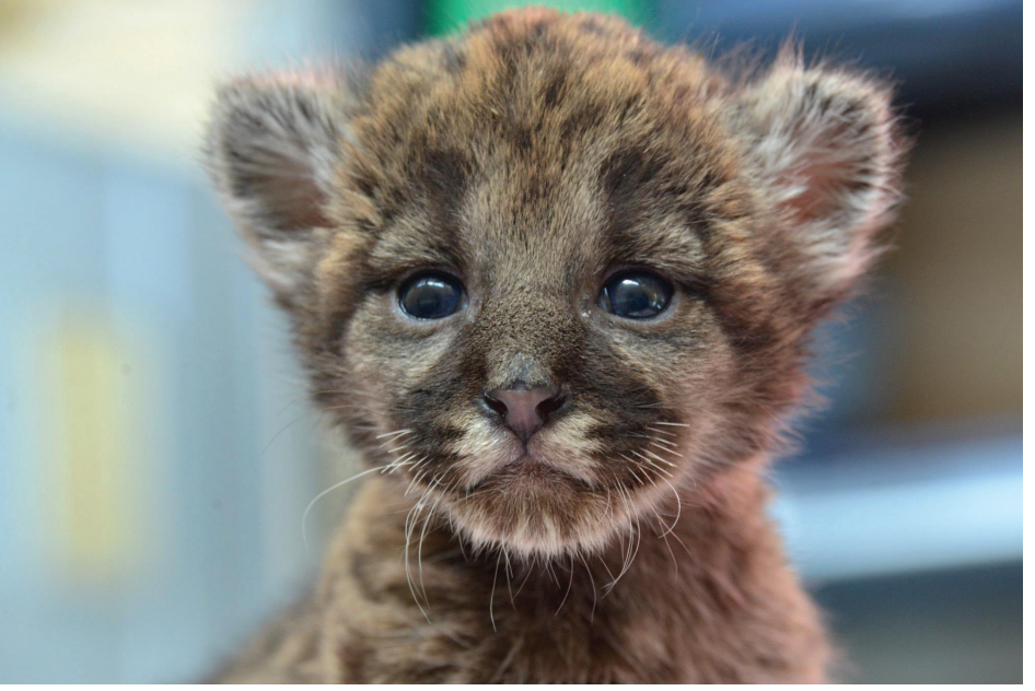
Panther pets will now be allowed to accompany owners in resident halls.

new initiative has been largely favorable, as residents cannot wait to bring their pets to school next semester, though many are content just to be sharing their buildings with so many doubtlessly adorable animals.