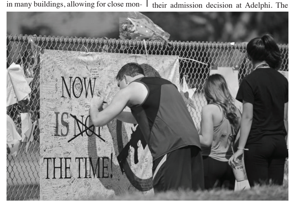
Students urge government to pass stricter gun control laws in light of recent tragedy.

He added that, on most days, there is a sector car driving through the streets bordering the university. Another strength of the university's security system is its 400 cameras around the campus and in many buildings, allowing for close mon-