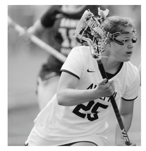
"Sports has and will always be my outlet and escape from life."

Growing up, you both always told me it was okay to be different and that I will have trouble hearing in crowds and experience a lot of background noise. I did everything "normal kids" did, like playing on sport teams, including becoming a competitive swimmer, going to sleepaway camp and everything in between. (Thank