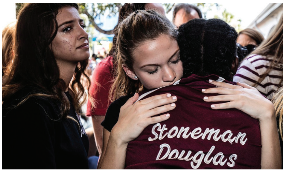
Shooting survivors mourn the loss of teachers and fellow classmates.

"We practice our responses to emergencies. Our Department of Public Safety is trained and prepared. Our local first responders are in contact with us regularly," she said. "Our policy regarding weapons on campus is strict. Section 10 of the Student Code of Conduct prohibits use, storage or possession of any gun, even if the person has a license. That means no guns, anywhere on campus. We enforce this around the clock, but if a student