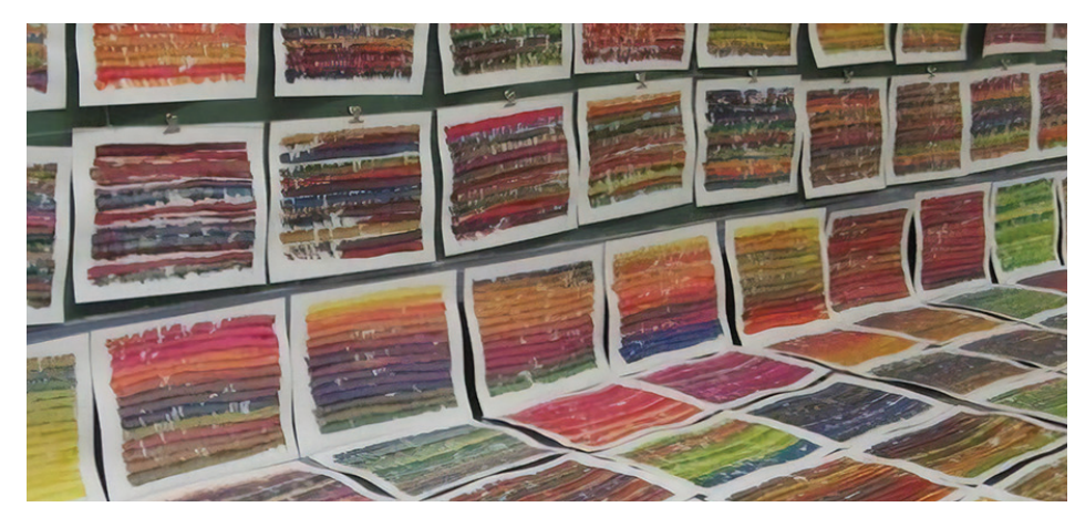
Pieces from the Kreyon Bondye Pa Gen Gonm exhibit in the UC in honor of Black History Month.