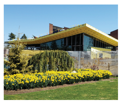
Progress made on the University Center will not stop due to the COVID-19 pandemic. However, many new safety measures are in place.

Whiting Turner was also working with the unions involved to reduce the amount of people working on the site at a time by offering workers split shifts over extended hours. Workers could stay clean and prevent spreading germs at several