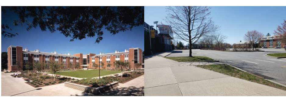
While almost the entire Adelphi community remains off campus in quarantine throughout the COVID-19 pandemic, there are some students who remain due to travel restrictions and personal circumstances.. Even so, you'd never know it to look at these photos.

In addition to the services listed above, many offices are now offering