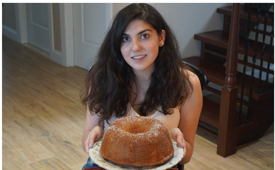
A cream cheese pound cake made for the last family party I had before quarantine.