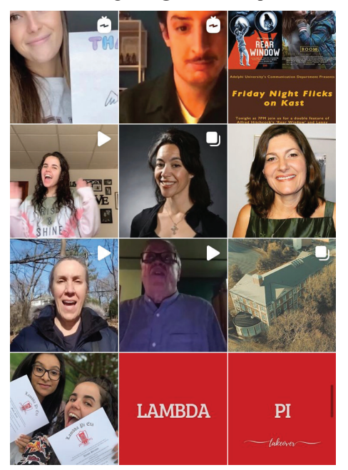
The AU Communications Department Instagram featuring student and faculty profiles.

You can connect with the department and choose to get involved by following them on Instagram @aucommdept.