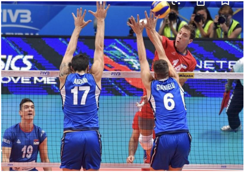
Men's volleyball is heavily competitive, leaving us to wonder what our school will be up against in the coming years.

With Adelphi already being named one of the most prominent athletic organizations across Long Island—the university was just officially cited Best Sports Program on Long Island in the Bethpage Best of Long Island contest (read about it in on page 16)—we can