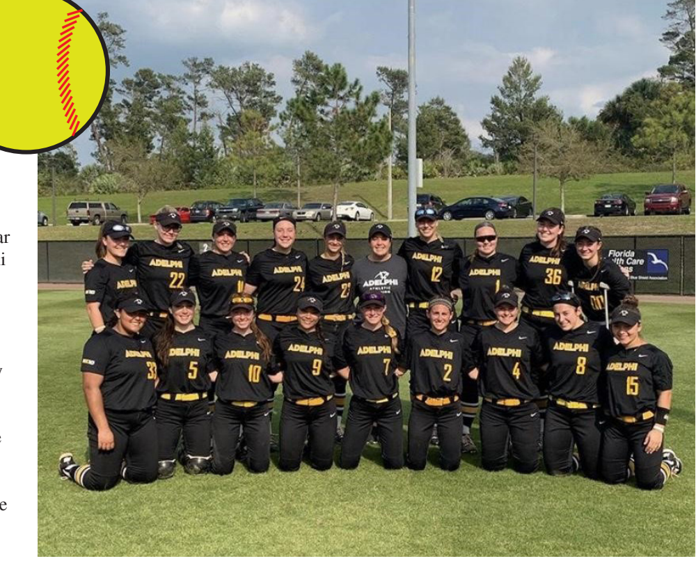
Adelphi's softball team enjoying the warm weather on their last day in Florida.

team chemistry is at an all-time high. I'm not concerned about the 4-3 start. We played two of the best teams in the conference for a three-game series. It is still early for us, we're going to keep grinding