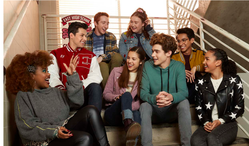
Soon Adelphi students will be able to hang out with these cast members as they come to campus to film the third season of their popular show. Autograph seeking is encouraged.

the newly renovated Center, Nexus, Swirbul and alls A and B. based on a movie I grew up singing along to and obsessing over is coming to my small college campus? Not only will