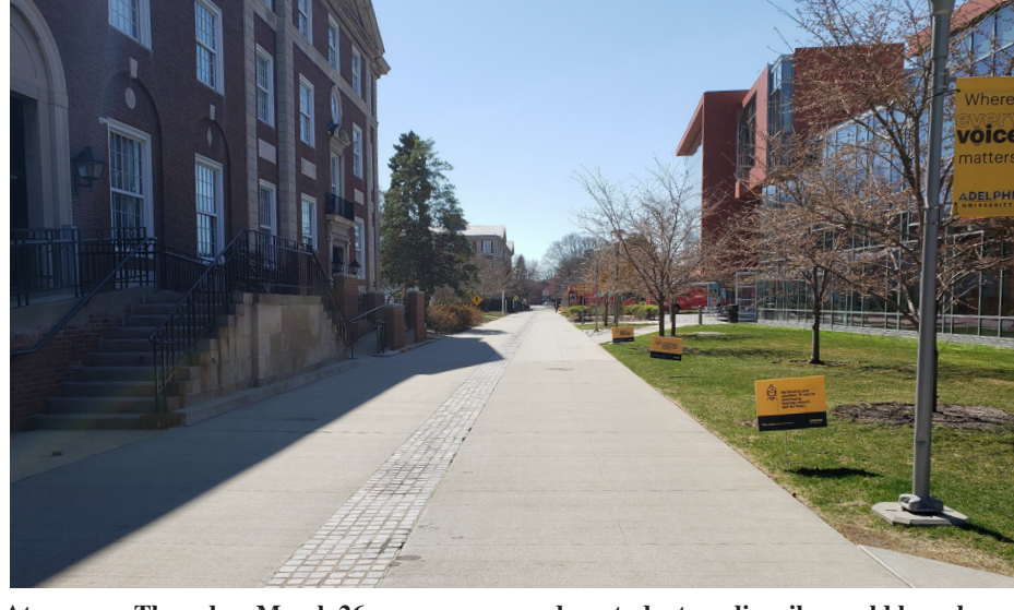
At noon on Thursday, March 26, a warm, sunny day, students ordinarily would have been swarming to these spots on campus. Due to the COVID-19-related shutdown, only a few essential vehicles and construction were to be seen.

While everyone is being affected by this global pandemic in different ways, Adelphi has made adjustments and changes in efforts to keep the community as safe as possible for the time being. But it's a lot to take in, so The Delphian has compiled a list of what you need to know about university operations throughout this temporary period of uncertainty, based on student body email blasts, Adelphi's coronavirus FAQ page and announcements made by Adelphi via social media.