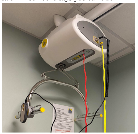
Adelphi's first-ever Hoyer lift machine, pictured in Swirbul Library, promotes equal access to individuals on campus with a physical mobility disability.

SAO needs voices like yours and when in doubt, remember what Lincoln said: "If someone says you can't do