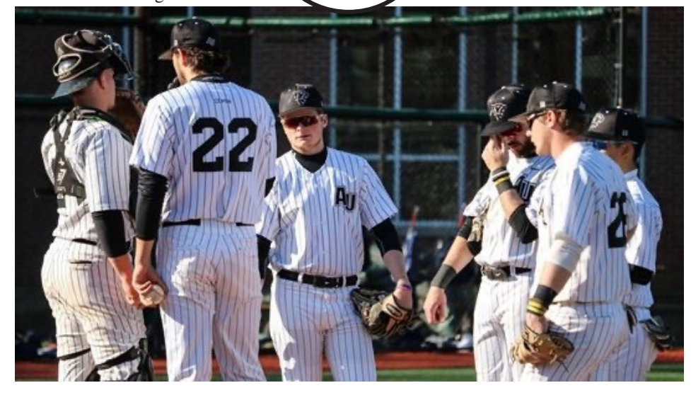
A few members of the Adelphi baseball team together throughout one of their games.

team chemistry is at an all-time high. I'm not concerned about the 4-3 start. We played two of the best teams in the conference for a three-game series. It is still early for us, we're going to keep grinding