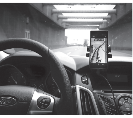
Are features like those on Waze and soon on Google Maps safe for use while driving?

safer for a traffic light or two, it's better than nothing. Police could always look into other means of preventing criminal organizations from prospering and set more enforcements for DWI's. The feature seems to only be expanding and could prove to be even more beneficial than it already has been.