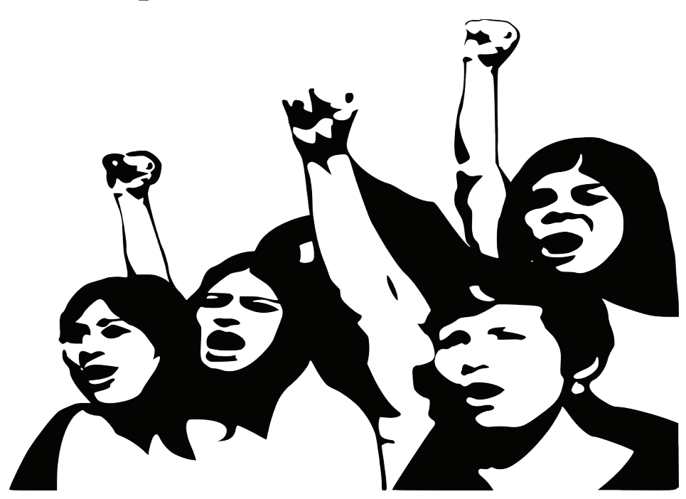
Students like those in Wisconsin protested for their beloved security officer's rights. Can the rest of the world take suit?