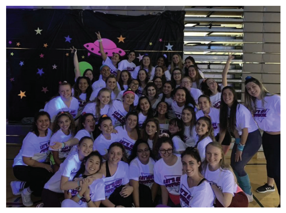
SAB Halloween: Delta Phi Epsilon Sorority using the 1980s as inspiration at SAB Halloween.

The first basketball court in the CRS was transformed into outer space to highlight the theme. The bleachers were covered with a black background that included alien heads and stars. Above the LED tables and the dance floor, there were glowing colorful clouds, light-up balloons and lanterns that acted as Adelphi's very