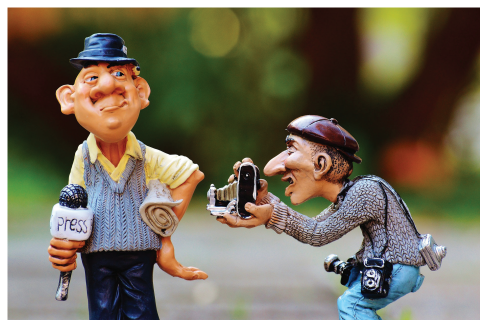
Some people accuse the press of damaging society with their reporting on the pandemic.

It truly angers me to see that people do not listen to Cuomo or our local legislators, like those near my childhood park, who have ripped the caution signs from