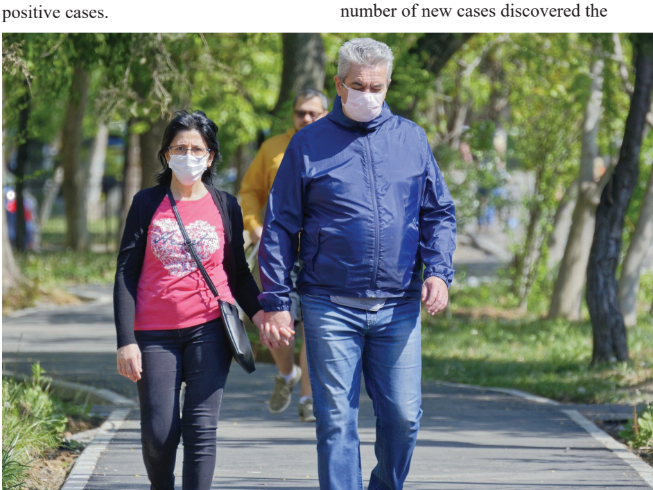
Lifting Georgia's stay-at-home orders may enliven the state's economy, but at what cost?

continue the isolation efforts they've been practicing, warning the state's citizens that "nothing has changed." This concern was warranted: after reopening many businesses May 1, the state noticed a spike in positive cases.