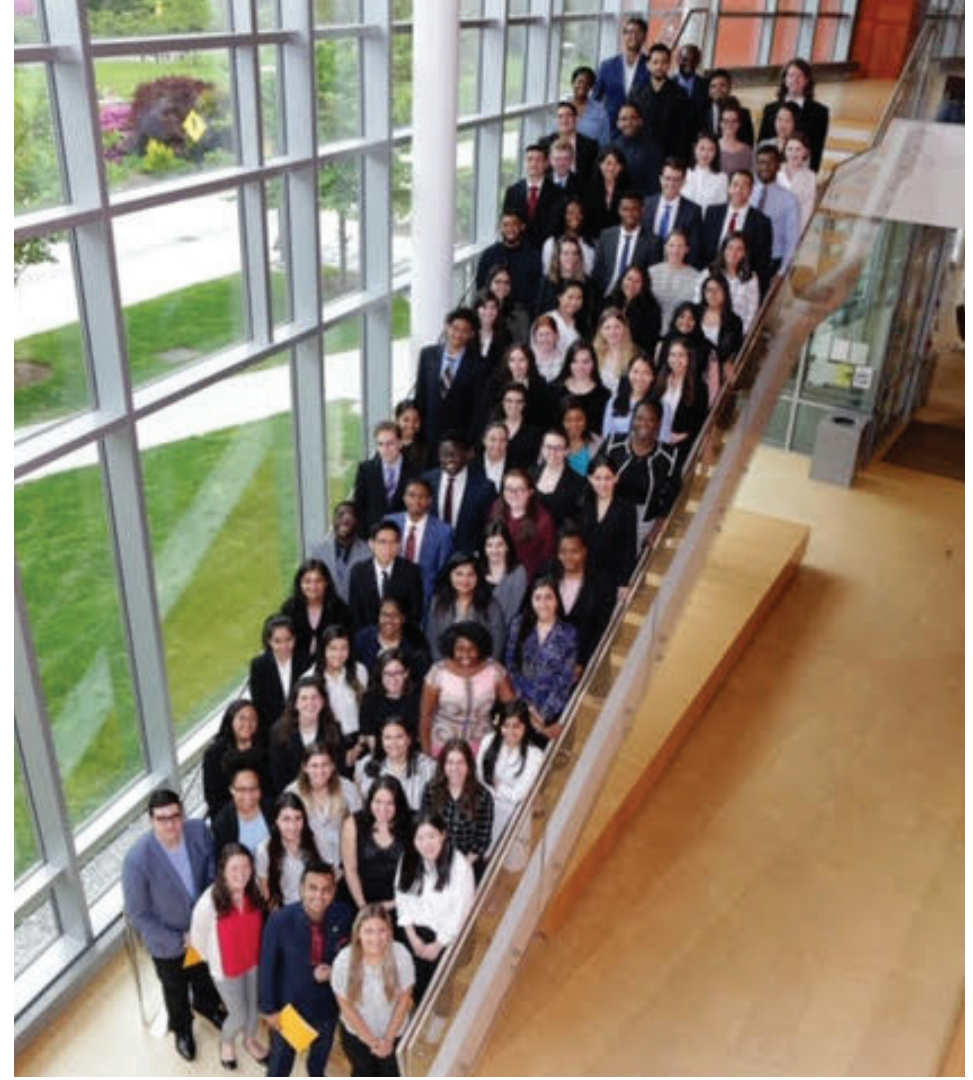
The 2019 Jaggar Community Fellows pose in Nexus.

"After hearing that many companies and nonprofit organizations cancelled their internship programs and field placements for students in nursing, education, psychology and social work, we were determined to make this program hap-