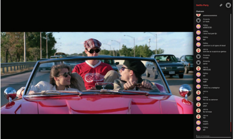
Screenshot from Ferris Bueller's Day Off via Netflix Party

As these current circumstances have limited our contact with each other. preventing us from our usual hangouts and mini adventures, my friends and I have made time for a group movie night every week. Starting every Friday since April 3 we've come together on Netflix Party and watched various movies and TV shows. Along with struggling to get everyone on Discord and FaceTiming every now and then, we may be apart, but we're still as