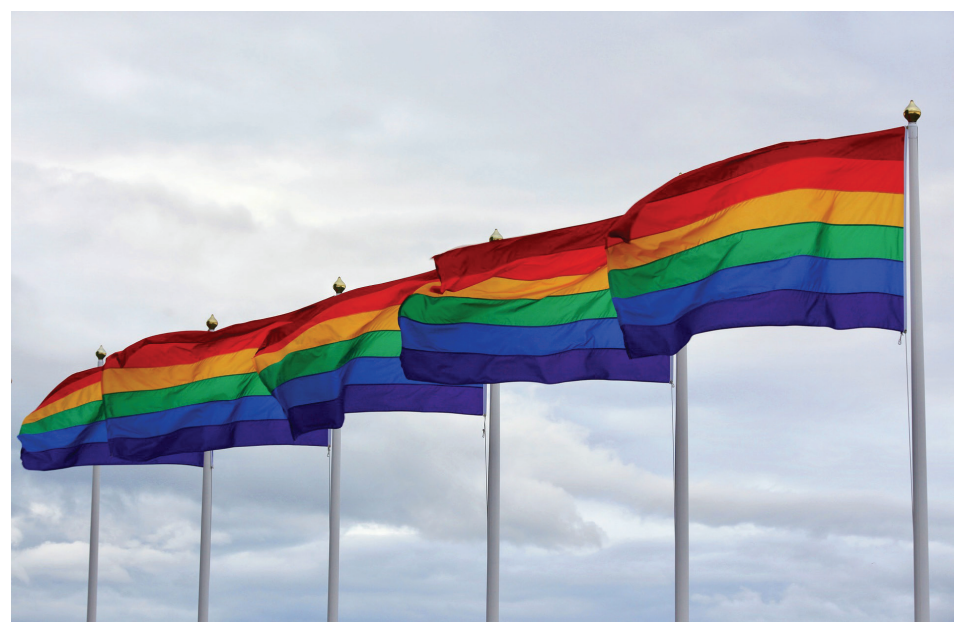
Amid the coronavirus outbreak, is now the best time to take away LGBTQ+ health care protections?

This move to eliminate Section 1557, which would allow hospitals to turn