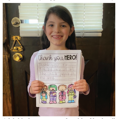
Adelphi has partnered with Northwell Health to provide 55 beds in Residence Hall B to health care workers. They were greeted with artwork from students in our Alice Brown Early Learning Center (ELC), who provided their cheerful messages through an ELC Card Campaign.

An email sent out by the university to the Adelphi community on April 17 detailed the ways in which we are providing community support. "With community