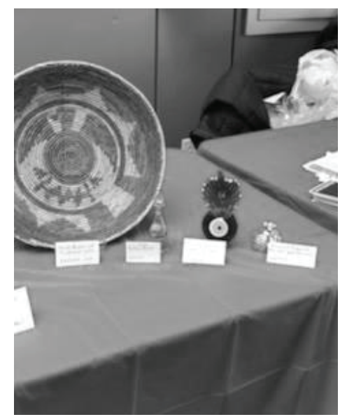
The Anthropology Fair had many fun and interesting tables including the ones seen in these pictures.

At the fair, one of the presentations was the range of courses and opportunities available. Participants, who were mostly students from Adelphi, got to ask questions about the displays and discuss their academic interests and questions about anthropology with available representatives of the Anthropology Department. Student-to-student interactions were abundant, and artifact displays promoting museum studies