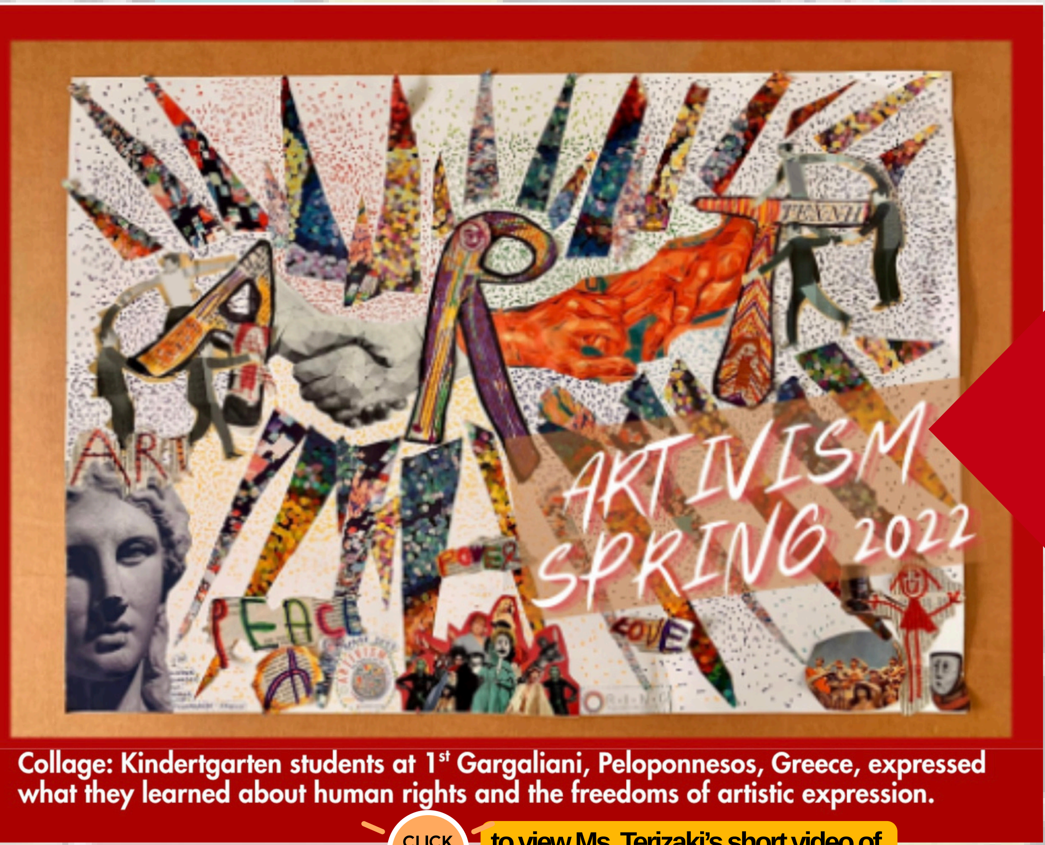
Collage: Kindertgarten students at 1 st Gargaliani, Peloponnesos, Greece, expressed what they learned about human rights and the freedoms of artistic expression.