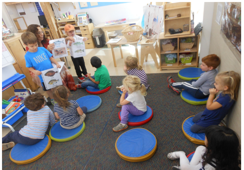
Sharing their work with the rest of the group.