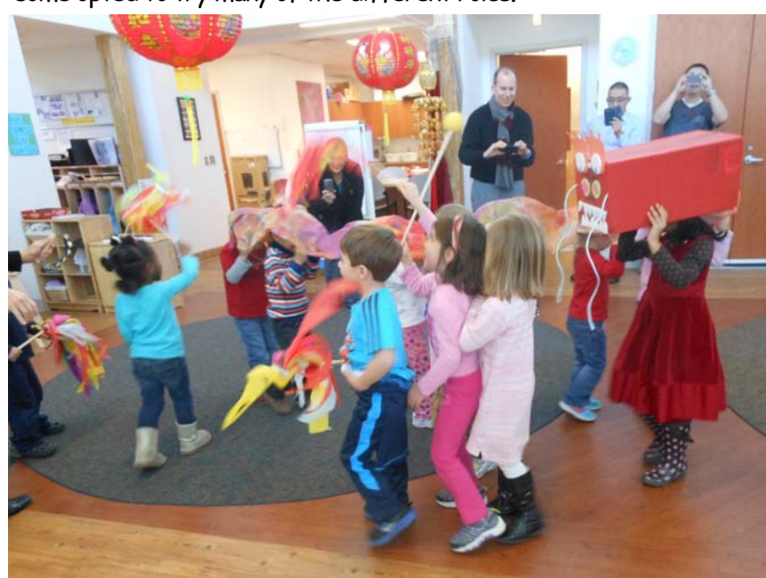
During morning meeting we listed the different things children could do during the Dragon Dance parade. Each child made choices and some opted to try many of the different roles.