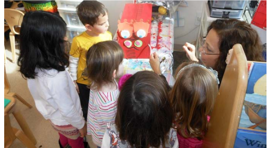
Comparing and experimenting with tools .