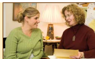
Class of 2009 Social Workers On-Campus Recruitment