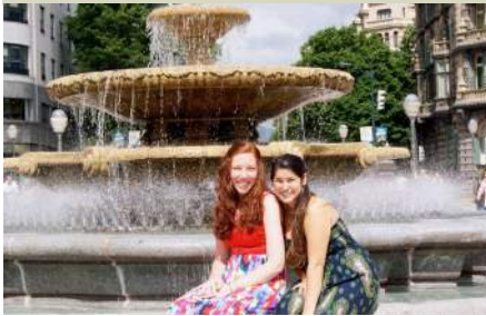
Two of our students enjoying their time on our study abroad program in Bilbao, Spain.