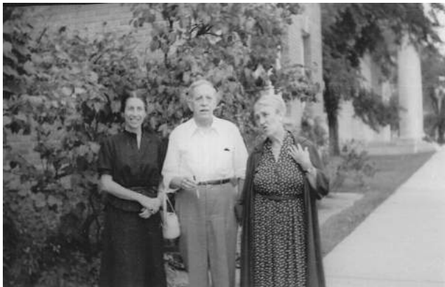
With Américo Castro, prominent Spanish literature critic 1949