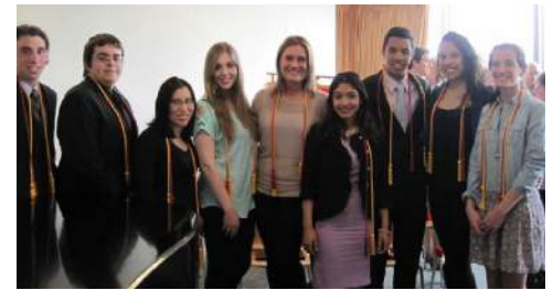
The newly inducted Sigma Delta Pi Class of 2013