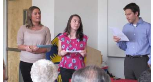
The Gamma Kappa Alpha Class of 2013 takes its oath