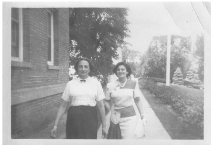
In Middlebury, VT, July 1949