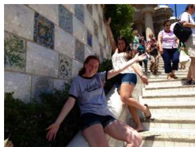
Seeing the sights in Basque Country