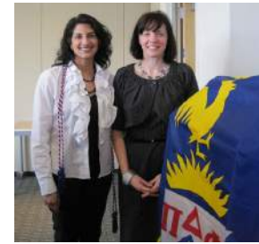
Let the induction in French begin!