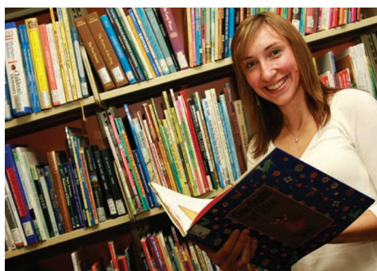
Bookworms welcome at the MC Library.