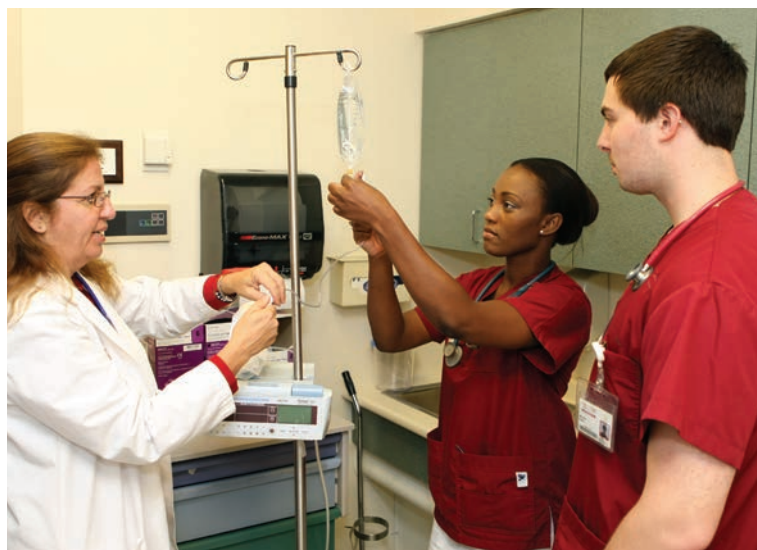
Nursing students polish clinical skills in a hospital setting.

Dressed in their scrubs, the nursing students carted out the blood pressure machines, thermometers, and a weight scale from the Nursing Department's laboratories and set up a table in the main lobby to distribute informational literature about healthcare and health risks. From 9:00 a.m. to 2:00 p.m., the nursing students checked other students' blood pressure and gave out pamphlets. It was an excellent opportunity for Adelphi nursing students to gain clinical experience with students from a number of other countries.