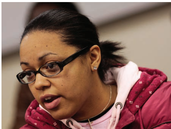
Tell me about it: Students exchange ideas in weekly Manhattan Conversations forum.

Manhattan Conversations started last fall to provide Manhattan Center M.S.W. students a weekly forum where issues related to the graduate school experience could be openly and honestly discussed, including professional development and the balancing act between being a student, parent, or significant other. One-hour conversations are held each