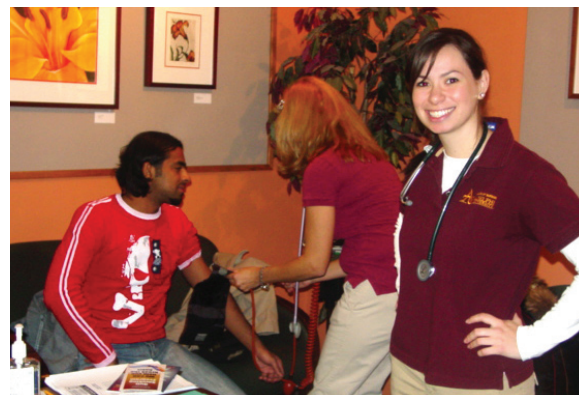
Taking the pulse: Nursing candidates check the blood pressure of Manhattan Center ELS students.

Created as a three-year initiative by the Greater New York Hospitals Association (GNYHA), the Program aims to address the city's growing nursing shortage by familiarizing nursing students with bedside practice, according to the GNYHA Web site. The Program, according to GNYHA, prepares experienced nurses to become clinical adjunct faculty in nursing schools and to act as preceptors to recent graduates in the hospital setting.