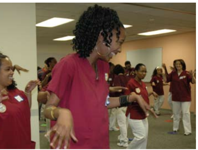
The right moves: NikeGo! Program teaches nursing students ways to keep preschoolers active