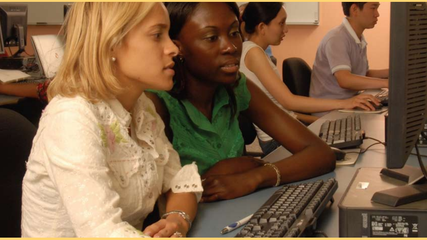
Students take advantage of the Manhattan Center's refurbished computer labs.