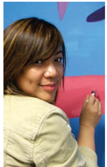
Painting with a purpose: Nursing students create a mural as the final project in their introductory drawing class.