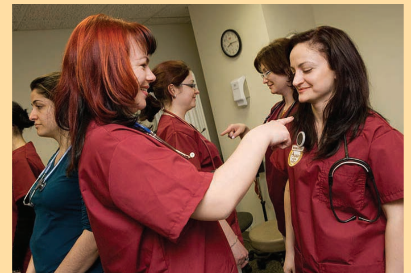
Follow my finger: Students practice ocular movement tests in the nursing assessment lab.

You can now take a virtual tour of the School of Nursing facilities at the Manhattan Center, including the recently refurbished nursing skills lab, complete with two patient mannequins; the nursing assessment lab, where students learn to measure vital signs; and the ultra-modern nursing simulation lab with "Mr. Simuel M. Jackson," a computerized human simulator. Take the tour online at www.adelphi.edu/manhattan/nursing.php .