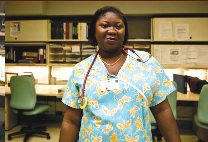
The end of a busy day