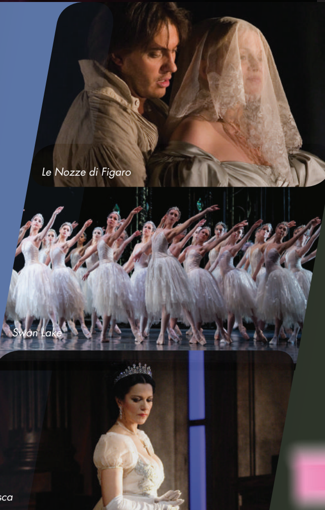
Le Nozze di Figaro

Should you require disability accommodations, please email DSS@adelphi.edu , giving notice of 72 hours before the event. Should you require ASL interpreting, seven days' notice is required.