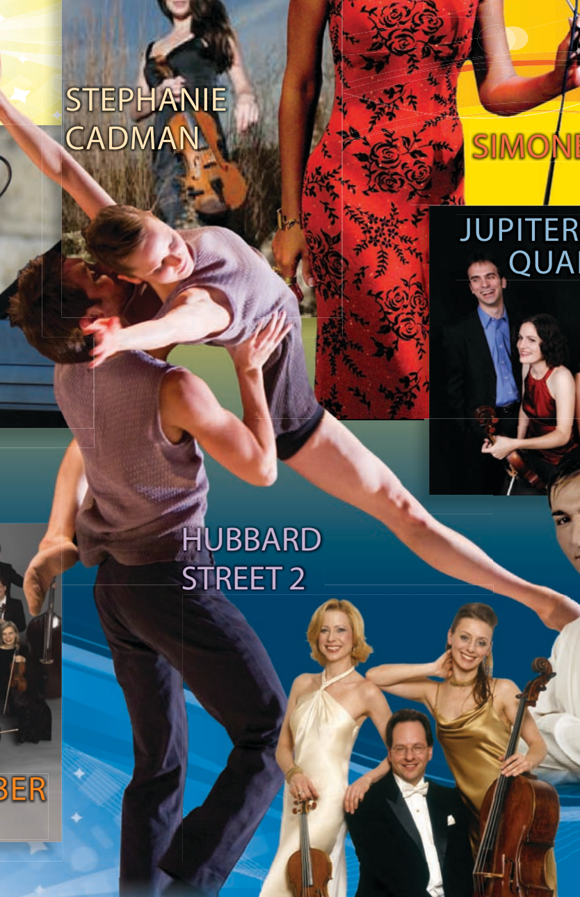
HUBBARD STREET 2