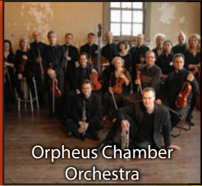
Orpheus Chamber Orchestra