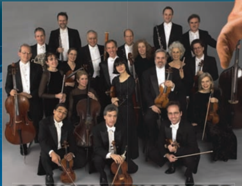
ORPHEUS CHAMBER ORCHESTRA