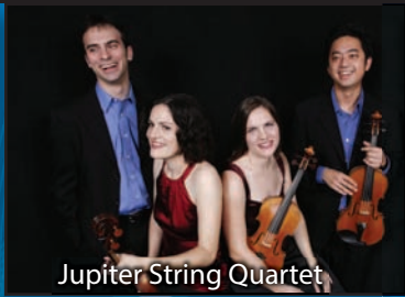
Jupiter String Quartet