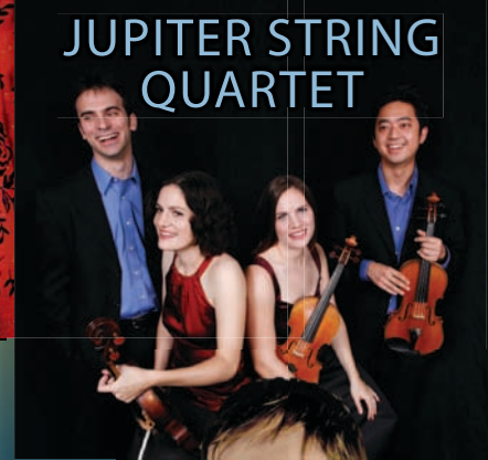
JUPITER STRING QUARTET