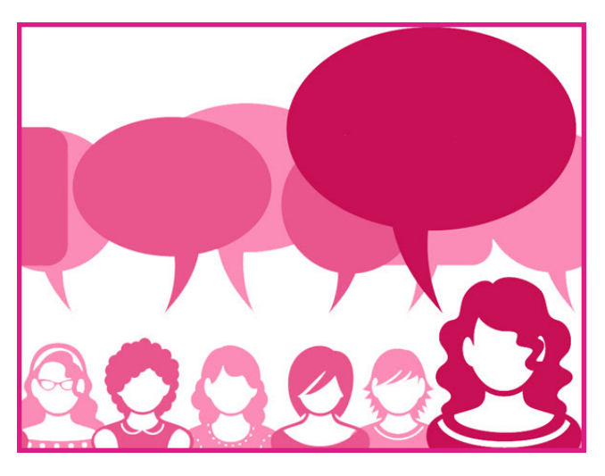
Reasons to connect to us on social media..