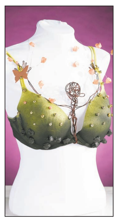
Paula Beck's Out of Darkness bra