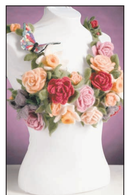
One of last year's Creative Cups entries

Creative Cups celebrates the lives of those living with breast cancer and